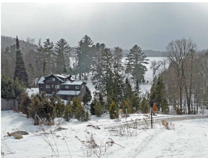
Figure 2: Limberlost Lodge and Lake Solitaire, near Huntsville, ON.

But all good things must come to an end, and so when the idyll was over we packed up and made the journey to our various homes. The difference this year is that the group, after much discussion, came to the difficult decision not to return to Limberlost in 2012. Sharply escalating fees made the decision inevitable. The search is now on for a more economical alternative for next year's adventure.